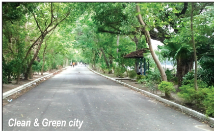
Clean & Green city

Kolkata is a beautiful city full of warmth and joy. Born and brought up here, I have fallen in love with the enchantment of this city which is neither too modern nor too rustic.