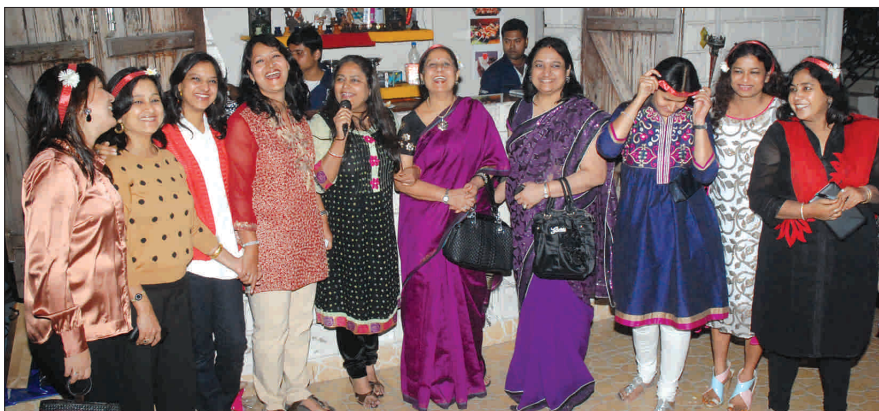
Members having fun!