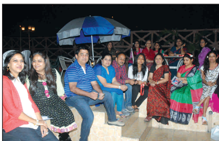
Bonding together & Bonding well!