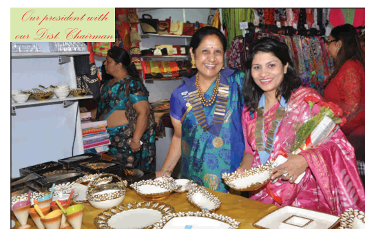
Our president with our Dist. Chairman

show, the first of its kind, drew a large number of calcuttans to the rink.