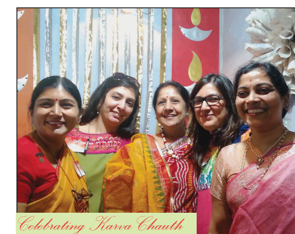
Celebrating Karva Chauth

Enthusiastic participants were very happy and satisfied with the press coverage in "The Telegraph" and with the success of the show. They