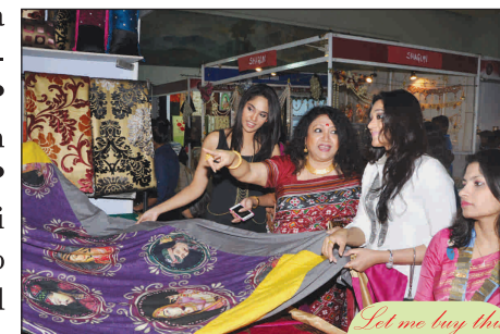
Let me buy this

Enthusiastic participants were very happy and satisfied with the press coverage in "The Telegraph" and with the success of the show. They