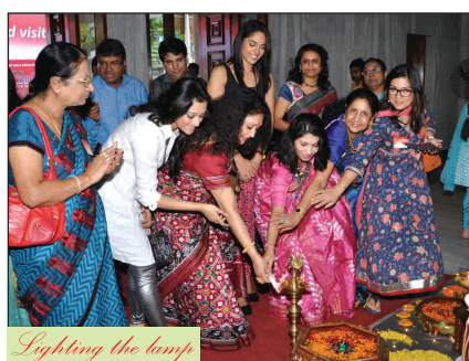
Lighting the lamp

Early in the morning our members took charge of each and every detail to go into the nitty -