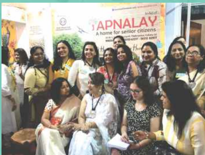
An adda session!