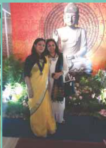
In the lobby