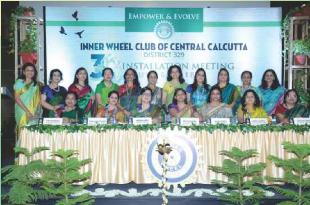
A New Vision!