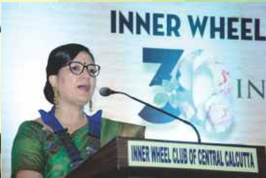
President's first words!