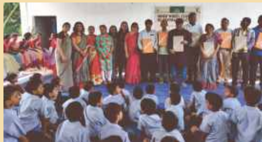
Acknowledging the future shapers!