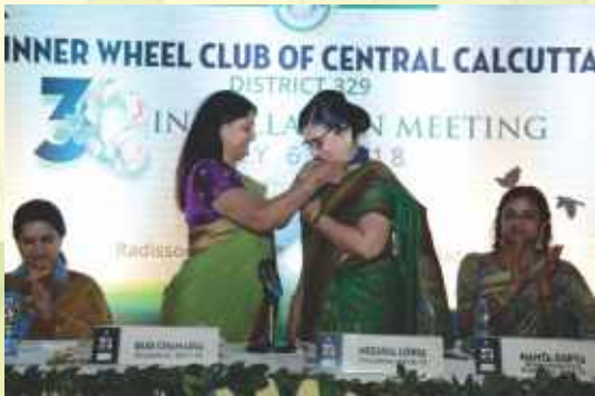
Gratitude and Good Fortune !