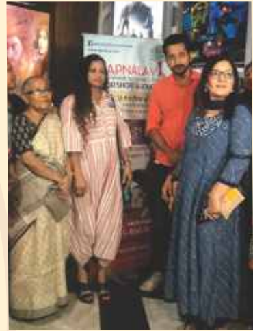
Our residents enjoying a movie evening with Parambrata.