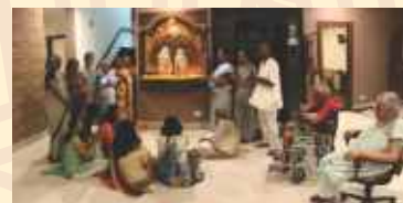
A Divine Blessing