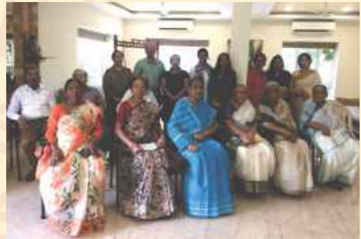
Love and Regards