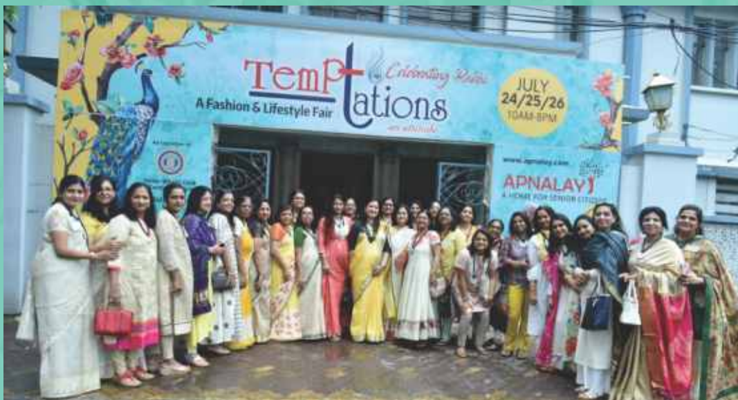
Together for a cause...