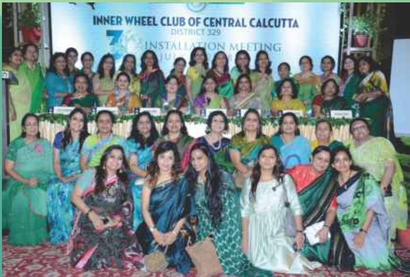
We are one- IWCCC Family!