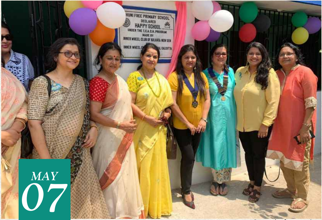
Strength of generations

On 7th May 2019 we inaugurated a HAPPY SCHOOL at Ghuni, Rajarhat on the auspicious occasion of Akshaya Tritiya.