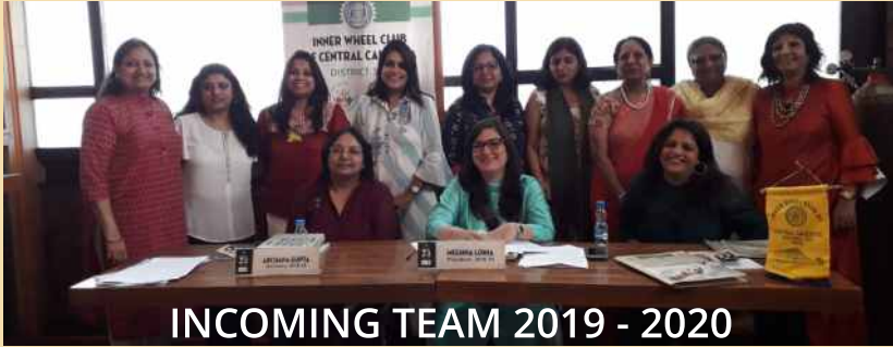
INCOMING TEAM 2019 - 2020