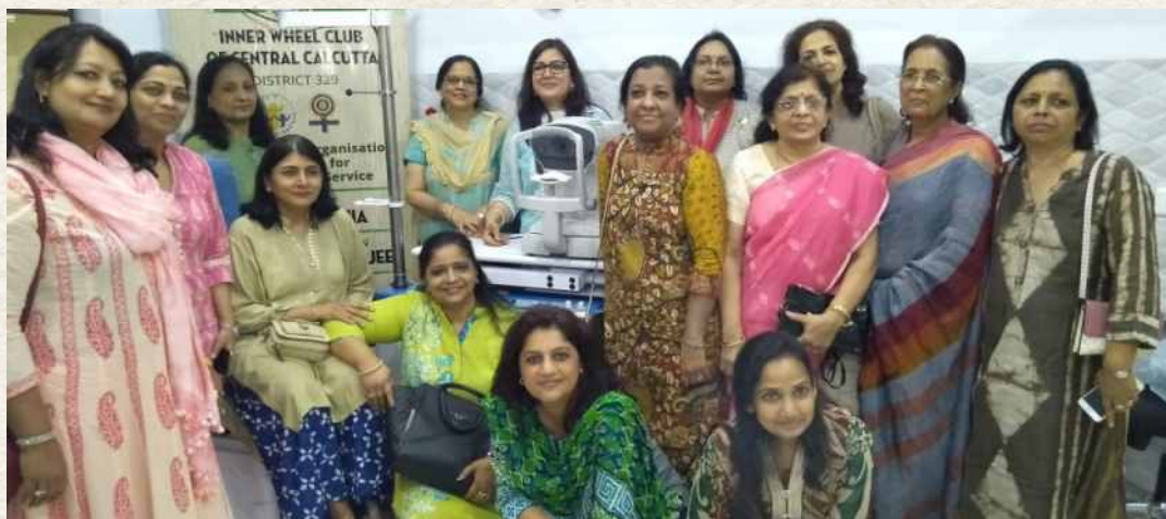
Gift of sight