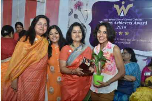
Recognition of Excellence.