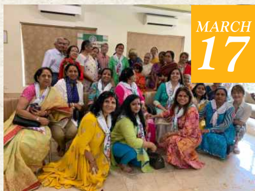
Hues of colours and flowers.

There were ample reasons for celebrations at Apnalay on 17th March. To name a few, the Club's Formation Day and The Festival Holi .