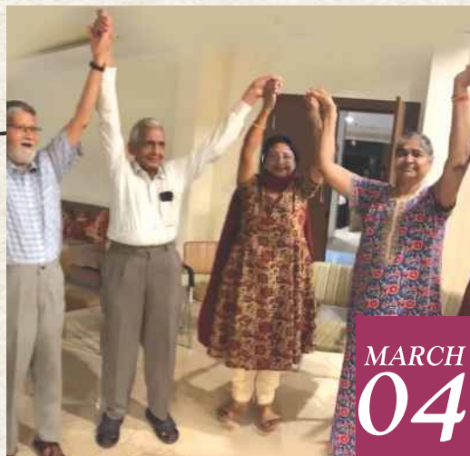
Movement brings joviality.