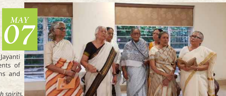
Together with high spirits.

On 7th may, The Rabindra Jayanti was observed by the residents of Apnalay. They recited poems and songs of Tagore.