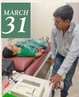
Doctor at work.