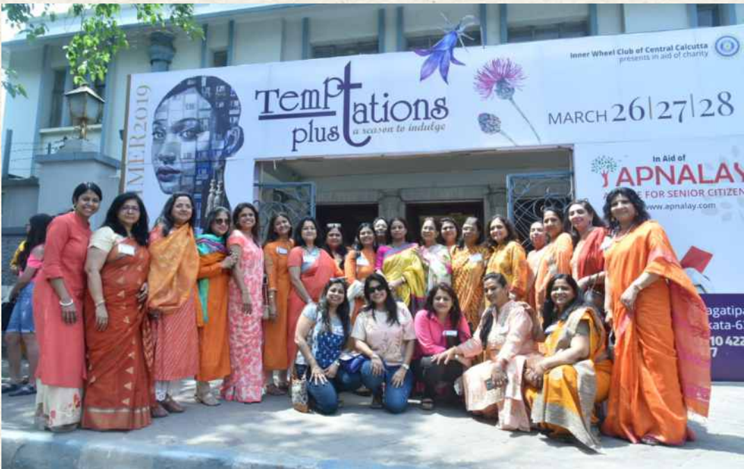
Indulgence in Temptations Plus