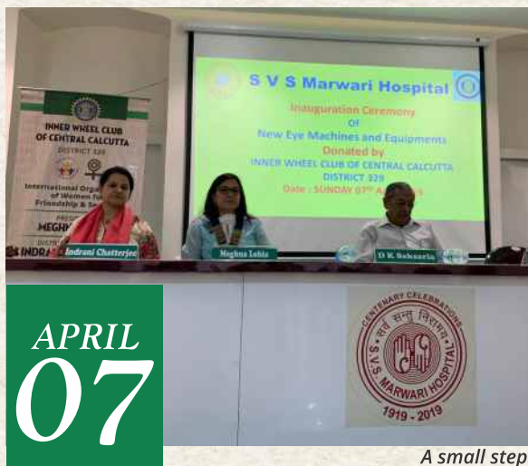
A small step..