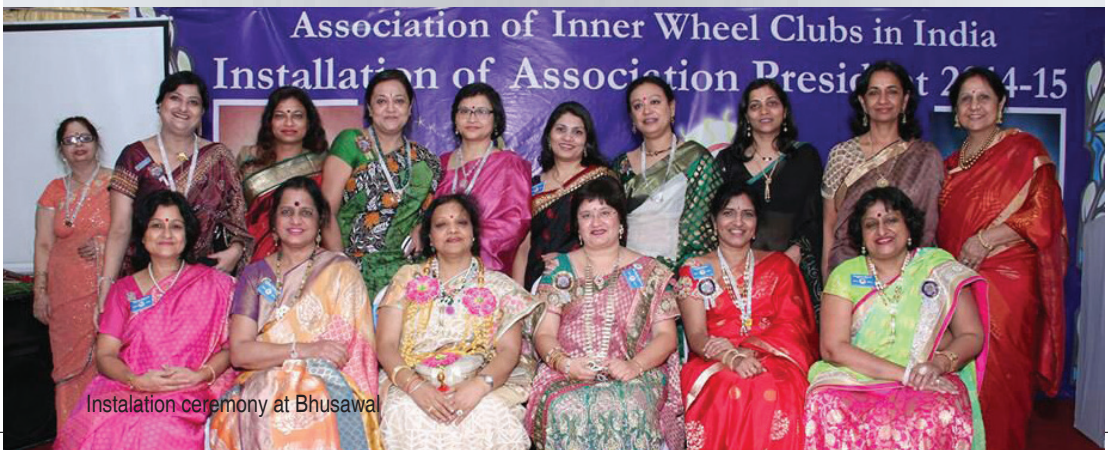
Installation ceremony at Bhusawal