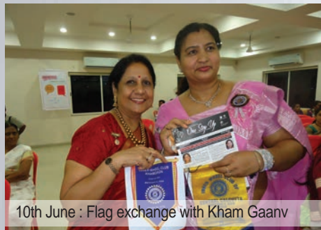
10th June : Flag exchange with Kham Gaanv

14th June – Celebrated Charter Day by donating sarees and sweets to the local residents of Pragatipalli, Apnalay.