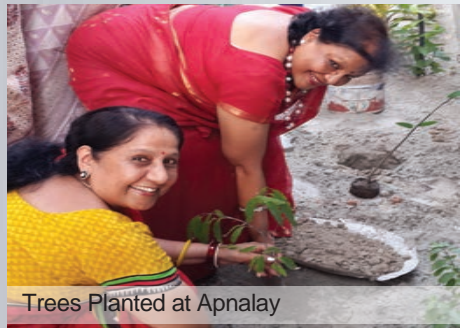
Trees Planted at Apnalay

18th May – Rs. 30,000/- donated to the welfare inmates of the correctional homes.