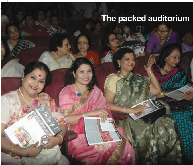
The packed auditorium