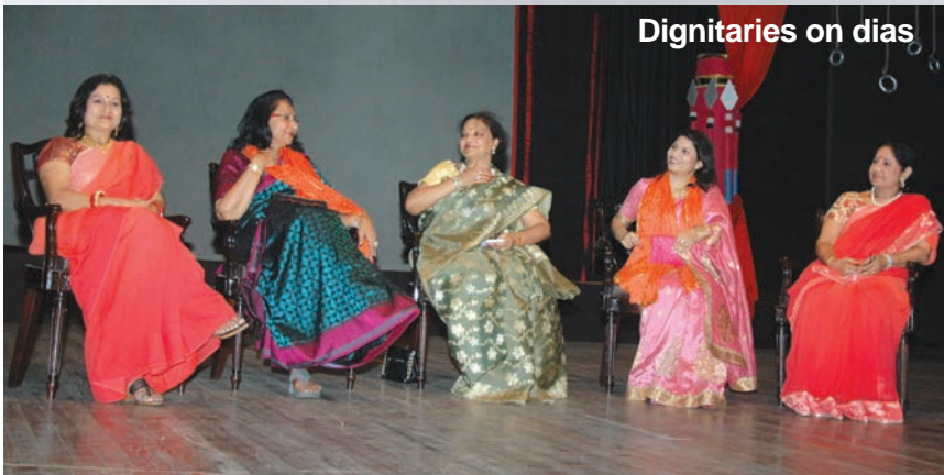
Dignitaries on dias