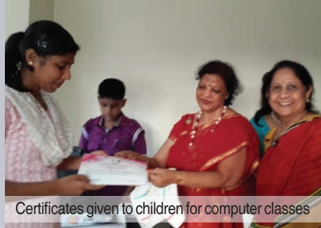
Certificates given to children for computer classes