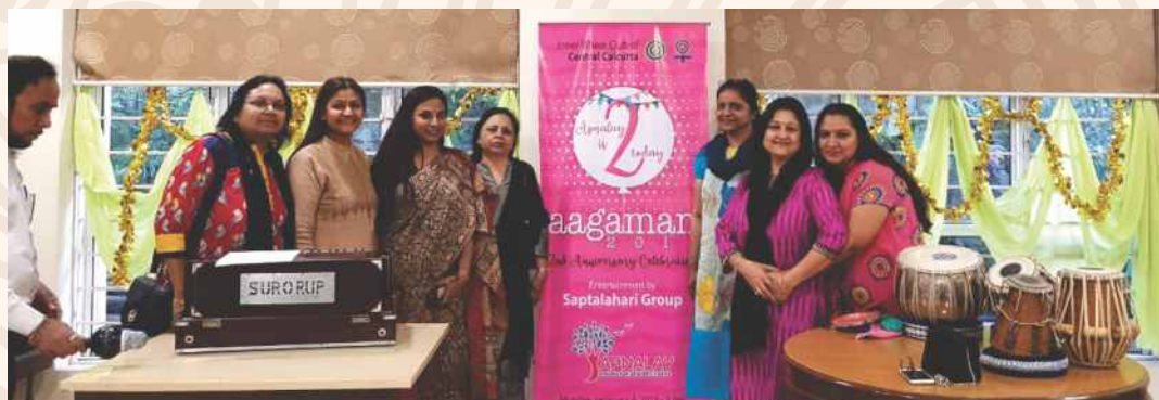
For the old but young in years