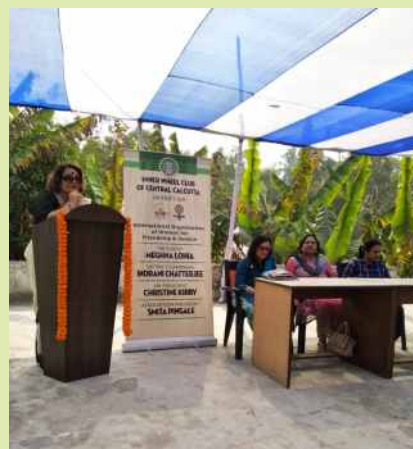
Acknowledging the generosity