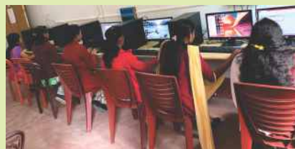
In tune with time