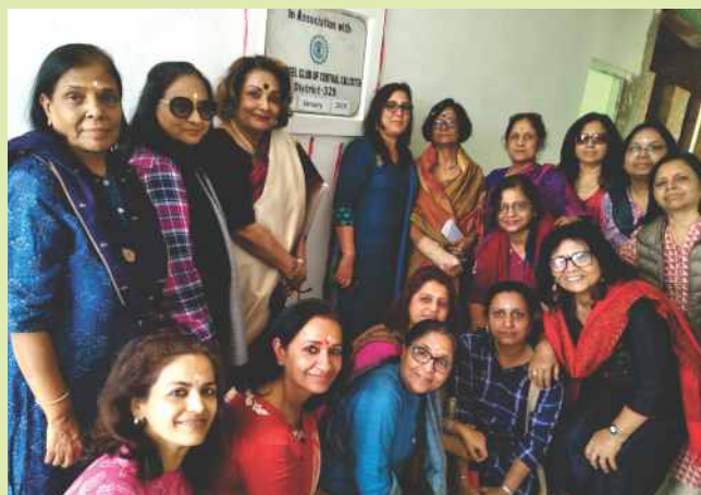
The moment of contentment