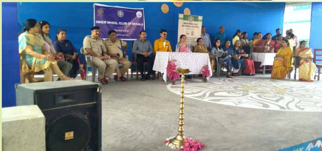
15 computers donated at Lathbagan

On 19th February 2019, our club participated in a little action that propelled forward the technical education of 500 young students. Latbagan High School is a school located inside the Army and Police Housing Complex at Barrackpore Police Academy for the officers' children and for civilian children. The school has a big computer room that caters to the educational needs of its students. Though well-maintained, there was a paucity of computers. Now, with our club donating 15 more computers , it is now well equipped to brighten those young minds.