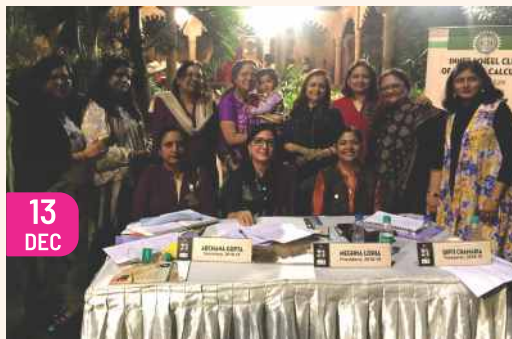
Congratulations!!! IIWCC Team 2019-2020