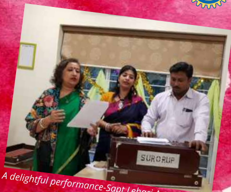
A delightful performance-Sapt Lehari Arts Group