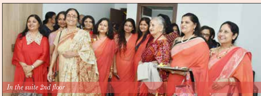
In the suite 2nd floor