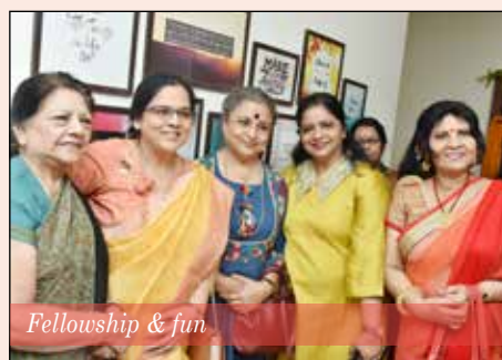
Fellowship & fun