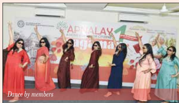
Dance by members