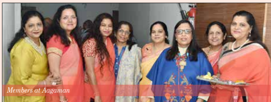
Members at Aagaman