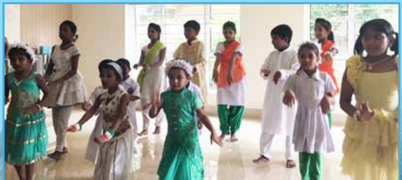
Khushi Vocational Centre