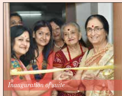
Inauguration of suite