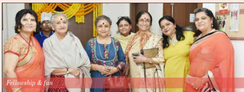
Fellowship & fun