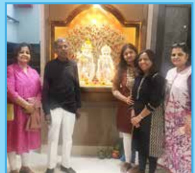
Welcome our first resident