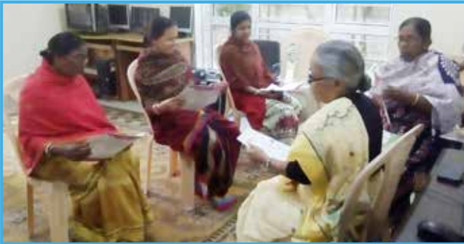
Adult literacy classes