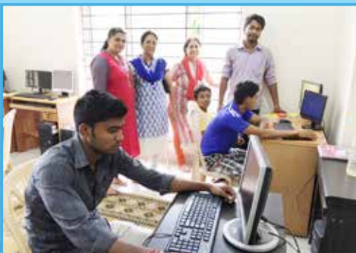
Computer training classes