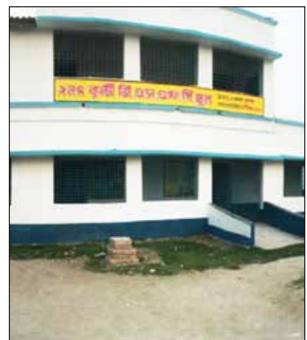
2 No Kulti GSFP School Post: Kantatala, PSKLC, 24 Parganas Bhangur, Tardaha VEC

Our next meeting will be on Friday, 6th April, 2018