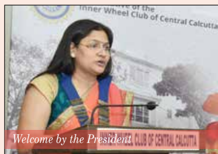
Welcome by the President