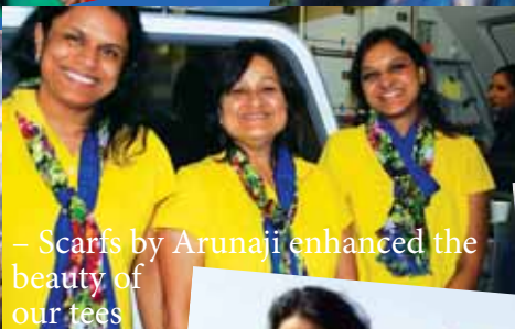
- Scarfs by Arunaji enhanced the beauty of our tees