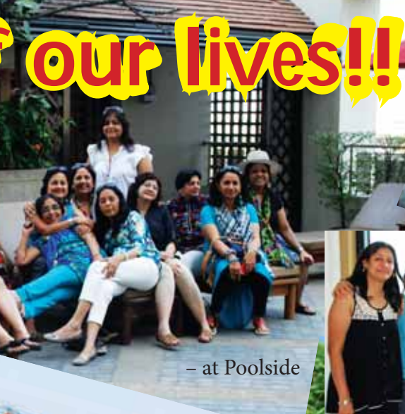
- at Poolside