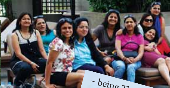
- being Thai in Thai