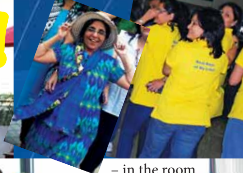
- in the room