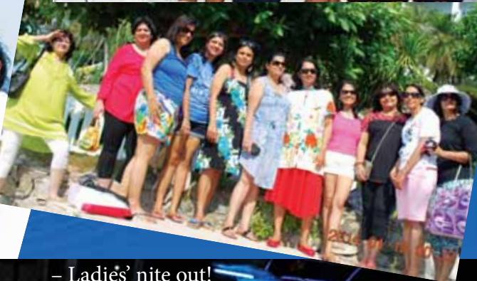
- Ladies' nite out!