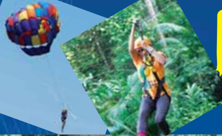
- Flight of Gibbon