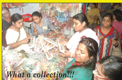
What a collection!!!