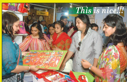
This is nice!!!